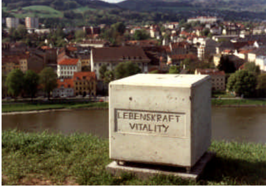
"garden of time-dreaming, Linz, Austria